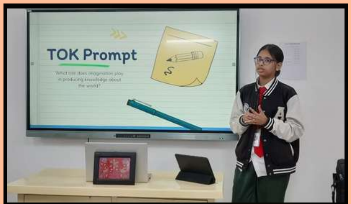
Students Take Turns To Present Their Mock TOK Exhibition Presentations