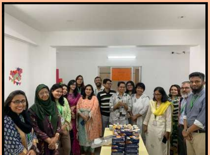
Teachers Take A Commemorative Photo For The Luncheon