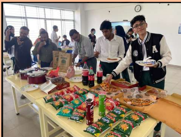
Students Catching Up With Each Other