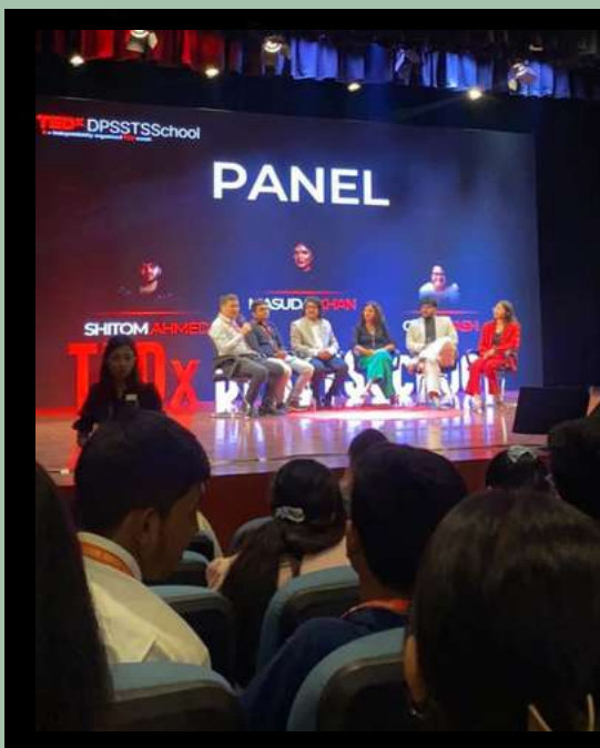
Renowned Speakers Discuss Various Topics On Their Panels