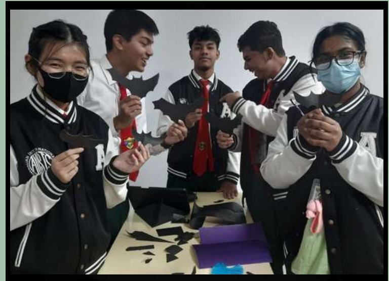
Students Exhibit Their Creative Skills Through Origami