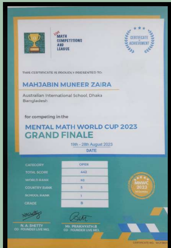
Awards For The Mental Math World Cup