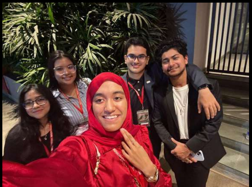
Students Take a Commemorative Picture