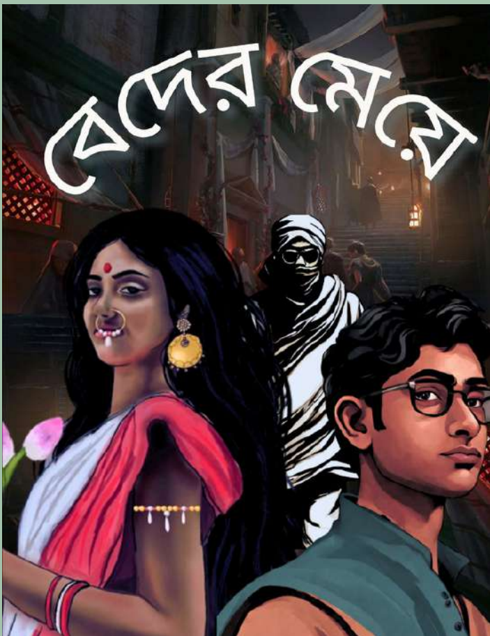
Poster for 'Beder Meye' by Samara Haque DP-1

Bangla literature is filled with remarkable characters, and in order to celebrate them, DP 1 students have embarked on a journey to bring them to life through the medium of movie posters! The students utilized their artistic skills, combining graphic design with their creativity and interpretation of these characters. They delved into these characters, the stories and the themes present. They translated their insights into visually captivating and thought-provoking posters.