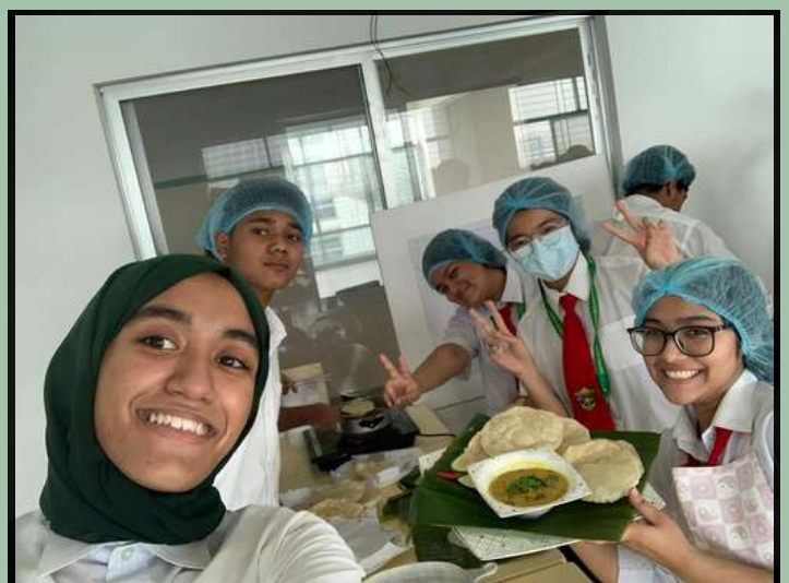
Students With Their Stalls