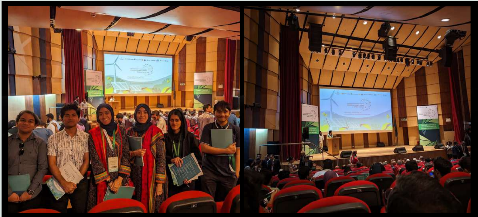
The DP-2 students attended the IUB conference.

The Climate Change Conference held on 23rd September 2023 in the IUB campus adopted a unique TED Talk format, giving attendees the chance to ask questions and engage with informative insights into the pressing issue of climate change. Approaches to combat climate change were also discussed. Encouraging energy efficiency and reduced electricity consumption, transitioning to low-carbon fossil fuel power, and increasing the adoption of renewable energy sources was discussed. Our DP-2 students had an invigorating experience.