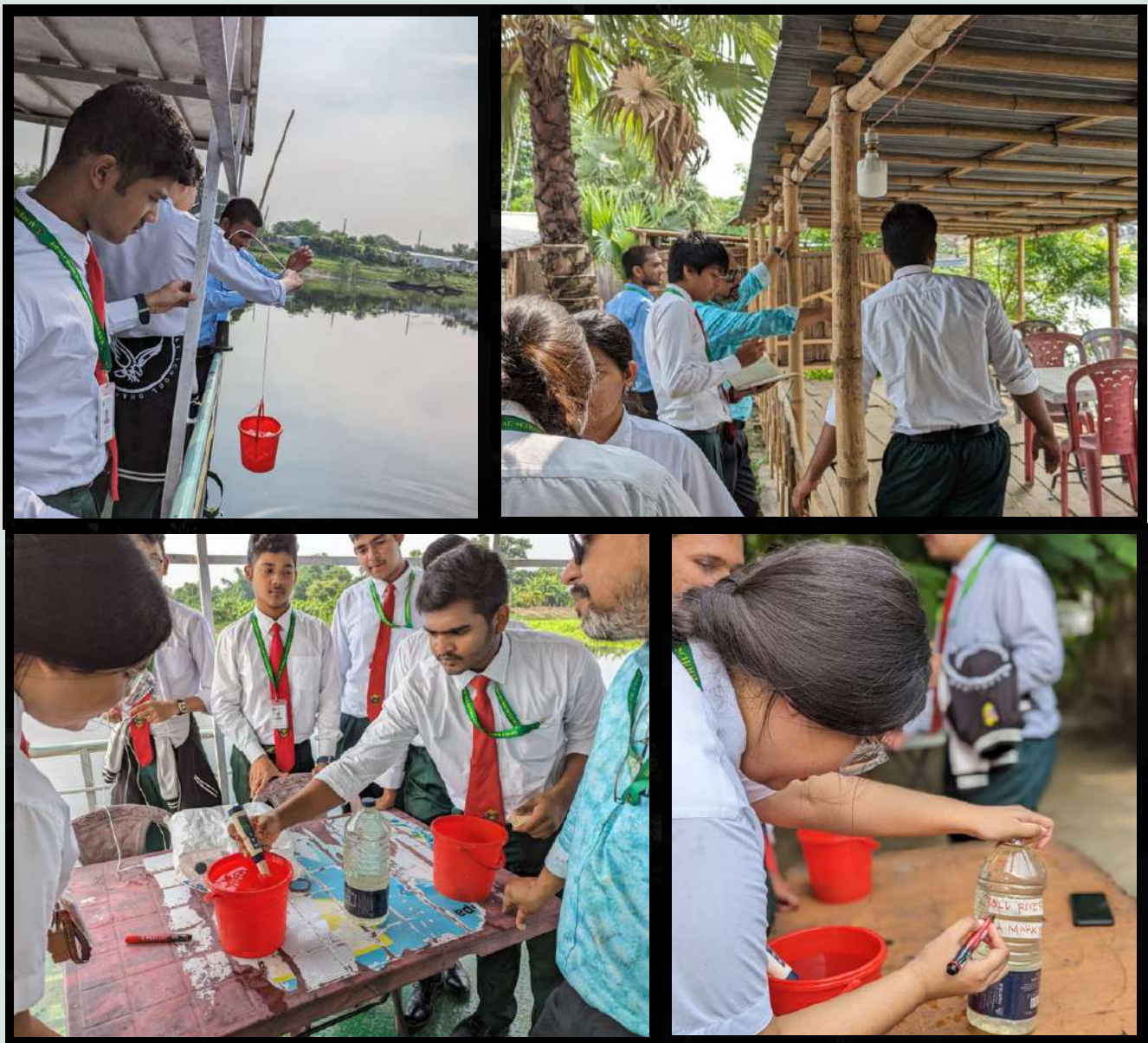
Students engage in water sample collection.

The ESS students recently embarked on an expedition to evaluate the quality of water bodies near us, focusing on factors such as salinity, temperature and pH levels. The sampling adventure took students to diverse locations such as Purbachal Eco Park and the bustling Nila Market. This is a continuous process with the students being able to procure more data regarding the quality of the data and later analyze them .