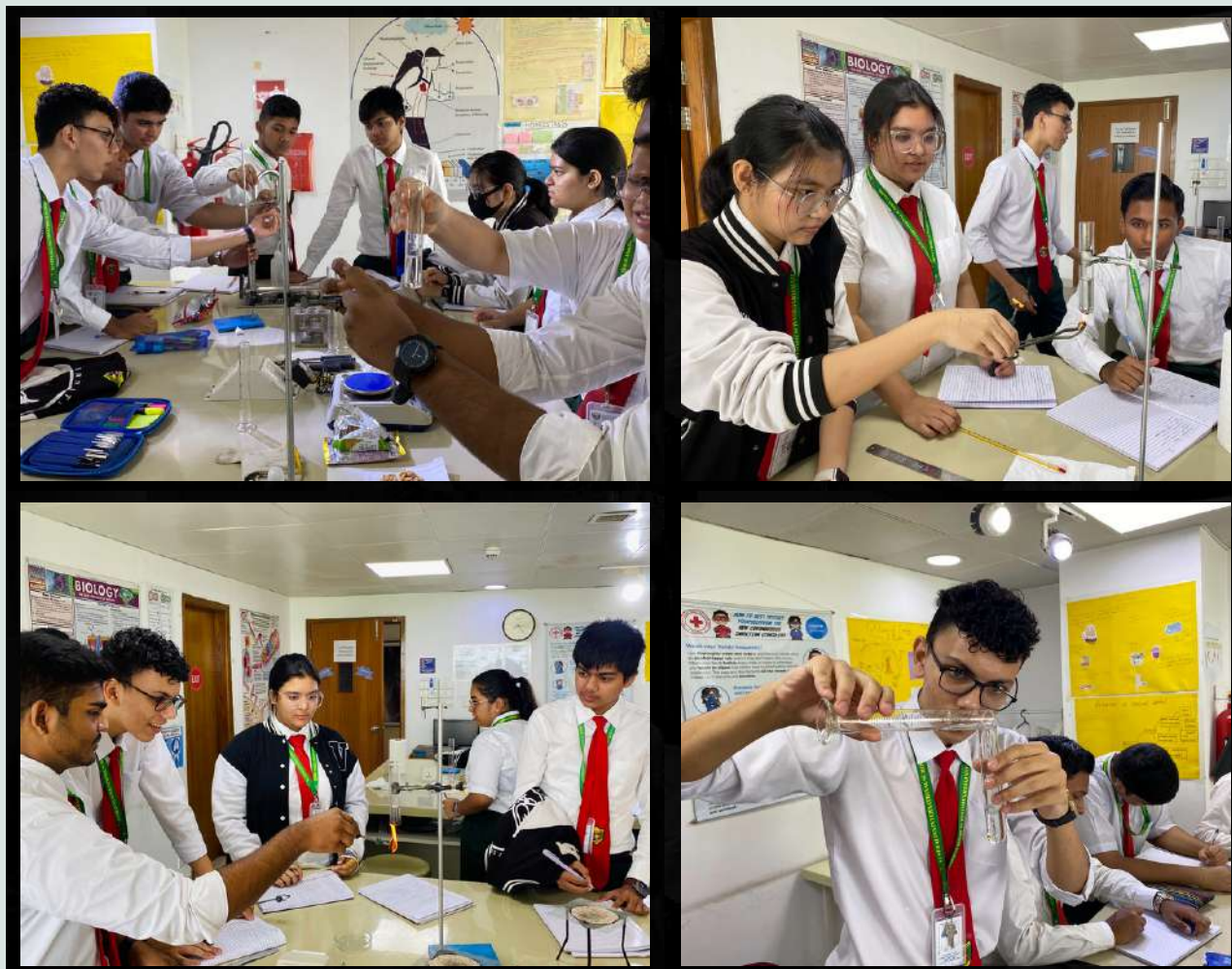
DP 1 students engaging in practical lab work.

On September the 13th, students from DP 1 conducted a lab on different food types having varying energy content stored in them. This experiment consisted of burning different food types - the ones the students used were chips, biscuits and peanuts. This was to see exactly how many calories of energy they produce.