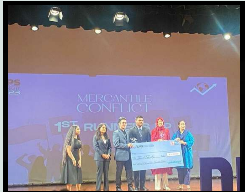
The DP Year 2 Students Being Presented their Award