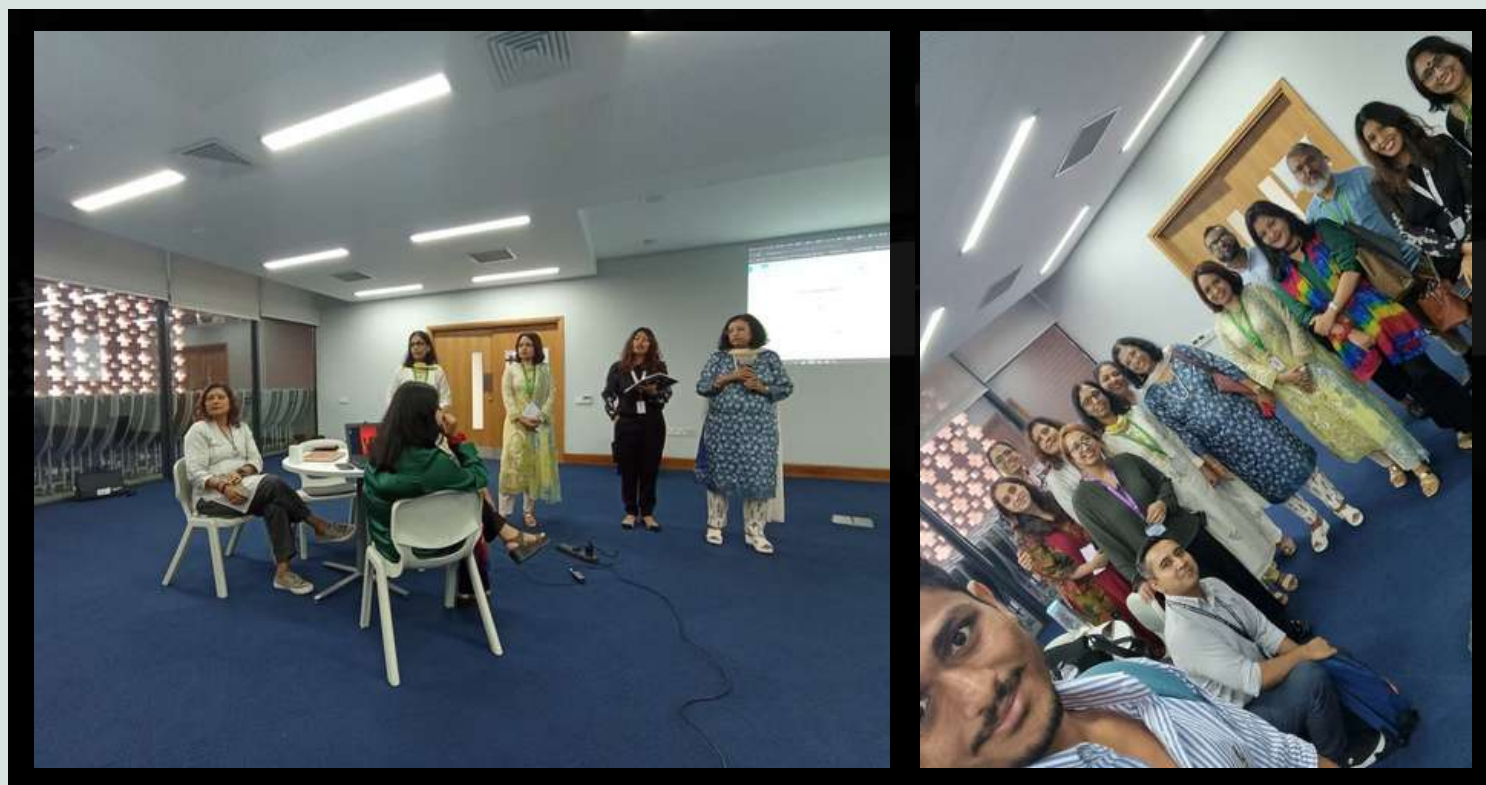
Teachers from different IB schools participate in unpacking of the TOK Essay Titles.

Overall, the session has proven to be a valuable experience for the AusIS team and has broadened the horizons of communication to create more opportunities for more collaborative sessions.