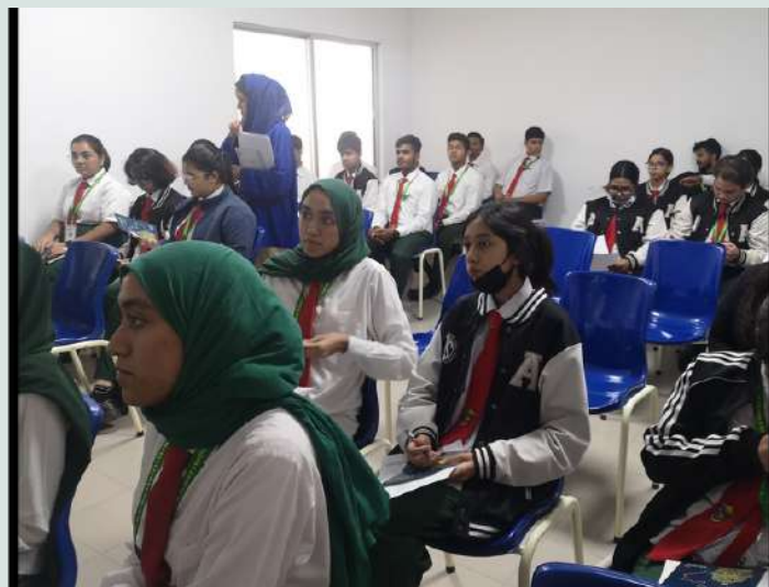
St. Mary's Representatives Providing Insight Into Life in Canada.