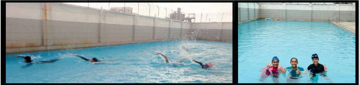
Students enjoying the swimming competition.

Our students from MYP-5, DP-1 and DP-2 partook in a swimming competition on the 14th and 27th of September. The students tried their best and we congratulate the winners.