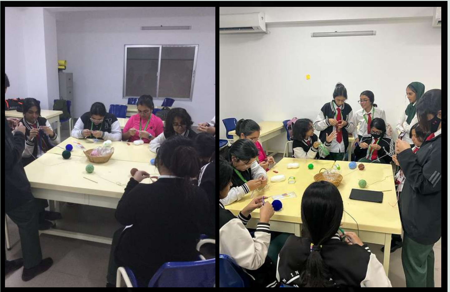
DP girls learning how to crochet.