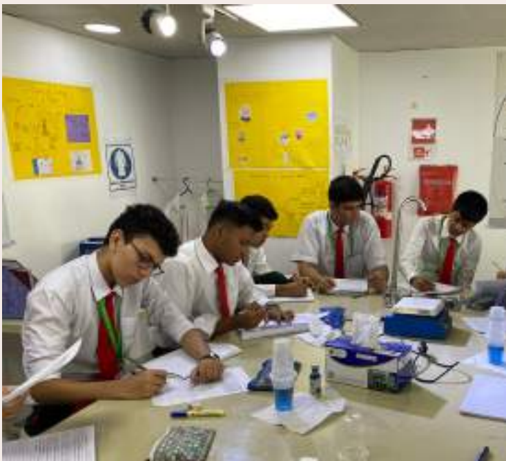
DP 1 students writing lab reports based on their observations.

Hands-on activities and investigations are a part of the teaching-learning process and students are experiencing by going into different science labs and doing different practicals. DP 1 students created a miniature water cycle model, while DP 2 students investigated the albedo effect.