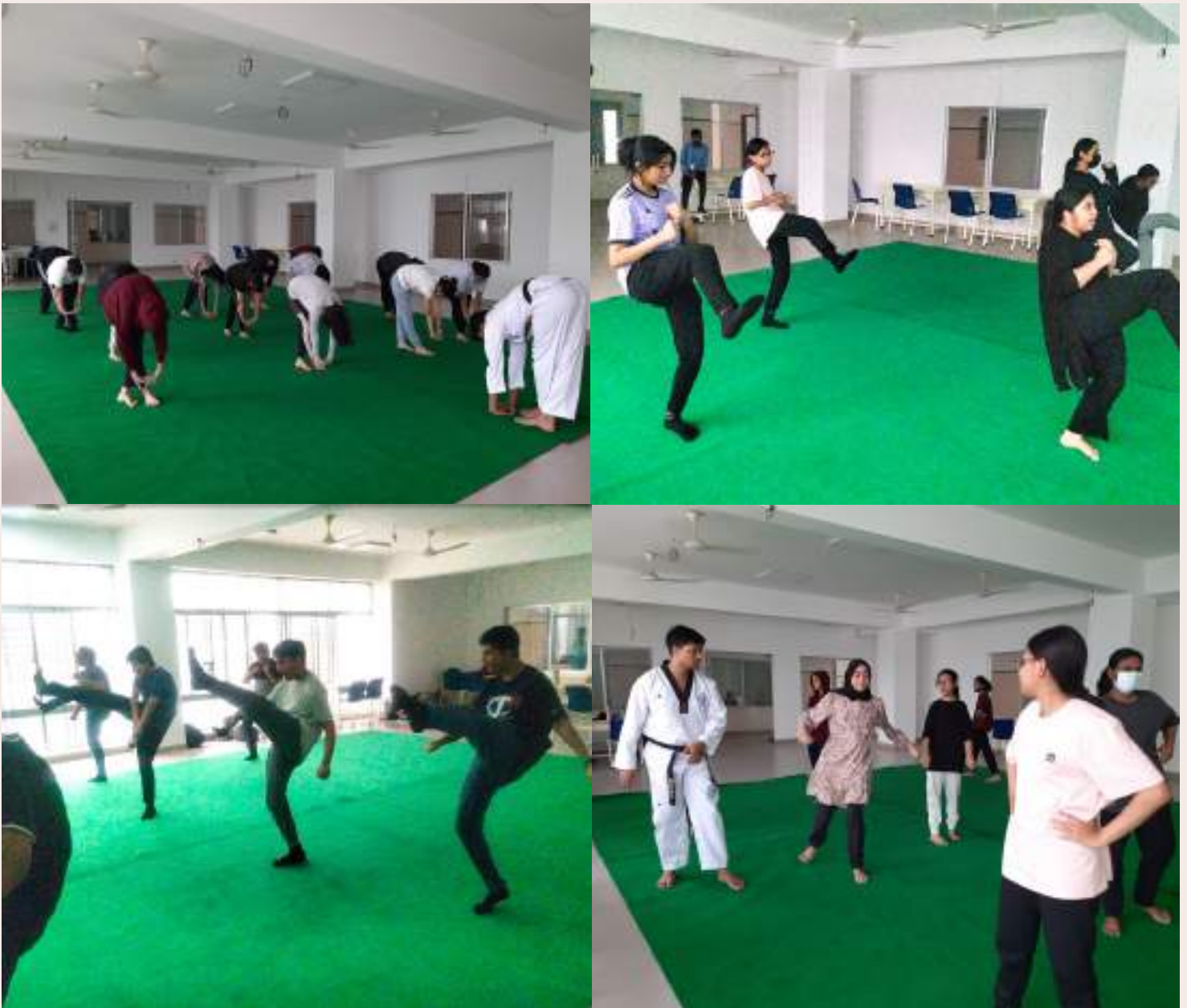
Students participate in learning self-defense.

DP Year 1 and 2 students started with their Taekwondo classes from 14th August 2023. These classes are conducted by professional Taekwondo instructor assigned by the Taekwondo Federation of Bangladesh. This physical activity is vital to build their discipline and physical fitness.