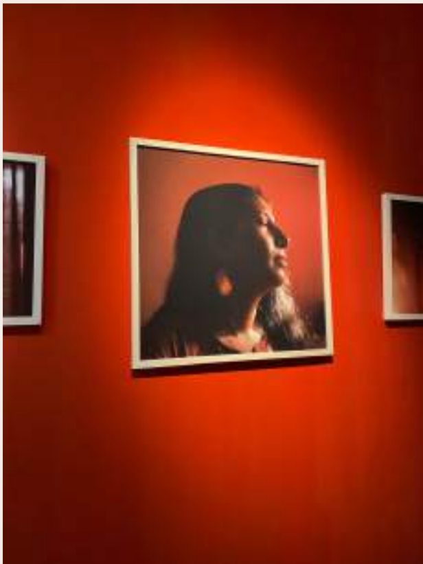
BUET Photography Exhibition at Shilpakala Academy