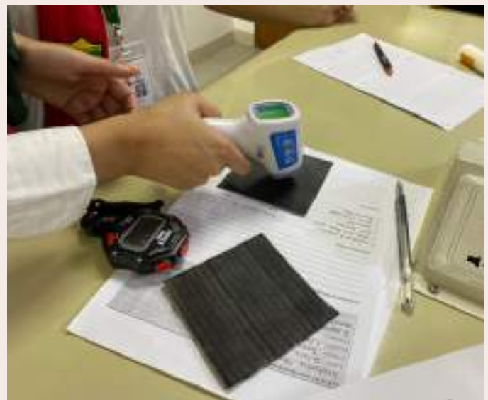
DP 2 students investigating surface reflectivity.