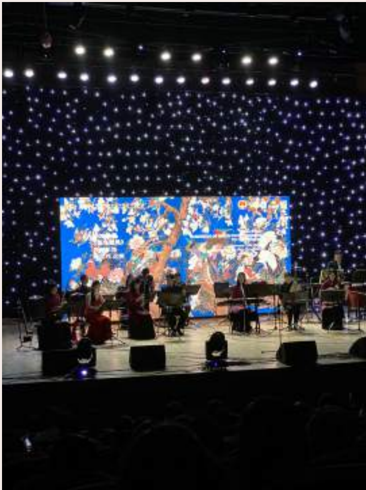
Musicians preparing their instruments.

Mandarin students of MYP Year 3,4 and DP Year 1 attended the "Silk Road Chinese Music Concert Bangladesh" organized by the Embassy of China at North-South University on 27th August 2023. This captivating experience offered Mandarin students a unique opportunity to immerse themselves in the essence of China.