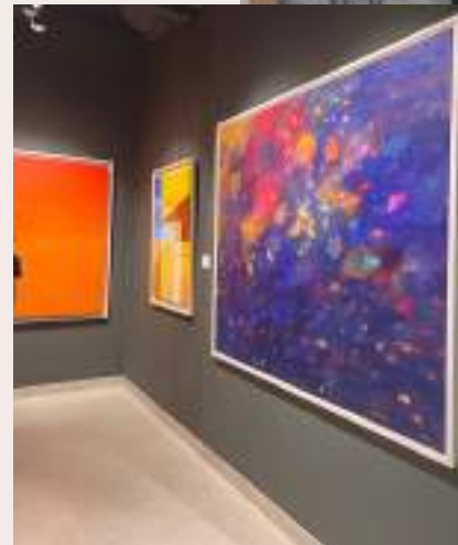
Edge Gallery Exhibition