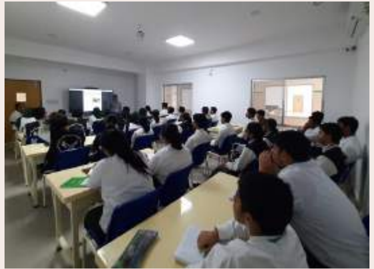
Students read a prepared infographic about MUN

From August 13th, 2023, the DP 1 and 2 students started with their weekly Model United Nations (MUN) sessions. MUN is an academic simulation of the United Nations and is crucial for students to develop a multitude of skills, including being more internationally minded.