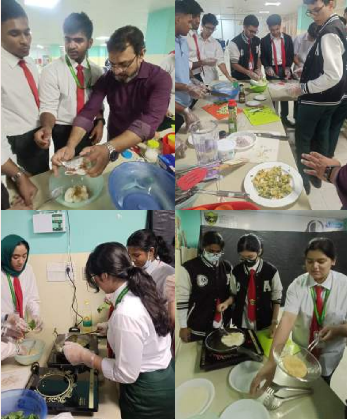
Students preparing Chaat Pakora and Luchi with daal.

Both DP 1 and 2 students began cooking as their CAS Creativity experience from the 16th of August 2023. They successfully made Spinach Chaat Pakora and Luchi with daal - two famous South Asian delicacies.