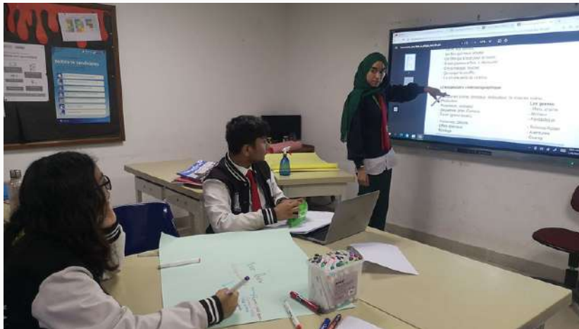
The negative impacts of migration on the ecosystem and the host country's environmental degradation were covered by ESS and English B students.

French B and English A students were tasked with creating posters on the elements of a movie review from the perspective of an English speaker, but all text was to be in French. English A students focused on the content of a movie review while French ab initio students worked on identifying the conventions present within a film and how they can be presented in the movie review.