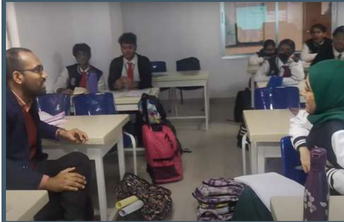
A collaborative class between Economics students and Digital societies students involved in exploring digital economies, namely cryptocurrency. Topics such as NFT's, Bitcoin, Meme coins and other aspects of digital economies were discussed.